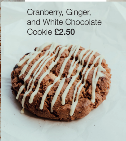
Cranberry, Ginger, and White Chocolate Cookie £2.50