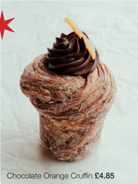
Chocolate Orange Cruffin £4.85